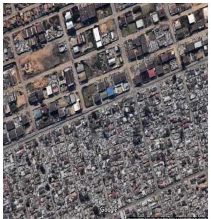
Google satellite image: Alexandra bordering Sandton

Poor people, especially the "urban poor" are indeed an important entity or group of the population governments cannot ignore. Challenges of "scanty informal property market data" and her justification of "Why the concern on dead capital?" is largely motivated by it being an important indicator of inequality in today's societies.