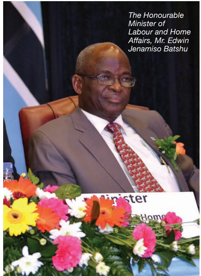
The Honourable Minister of Labour and Home Affairs, Mr. Edwin Jenamiso Batshu

Hon. Batshu applauded the participants as very essential to the development of Africa especially on elements of