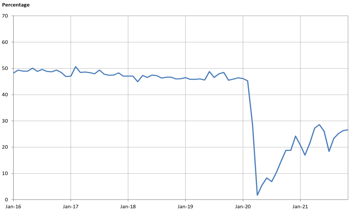
Figure 1 – Seasonally adjusted occupancy rate for the accommodation industry