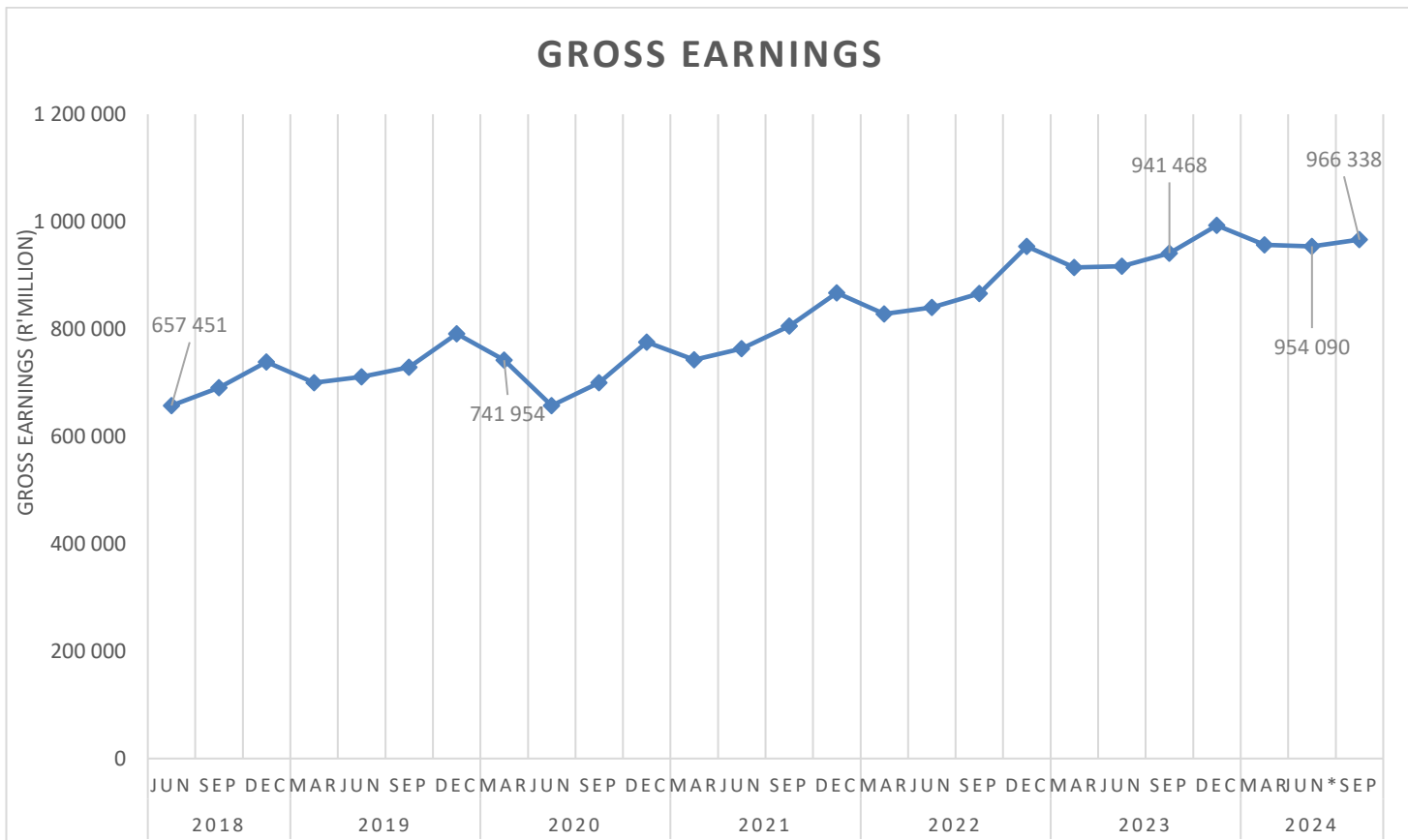
Figure B – Gross earnings of employees in the formal non-agricultural sector, June 2018 – September 2024

Part-time employment decreased by 250 000 or -17,8% year-on-year between September 2023 and September 2024.