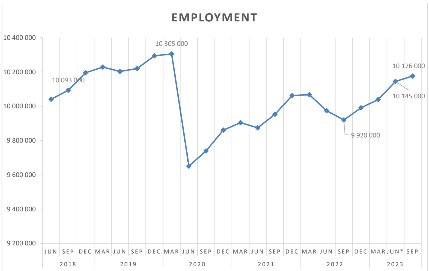
Figure A – Employment in the non-agricultural formal sector, June 2018 – September 2023