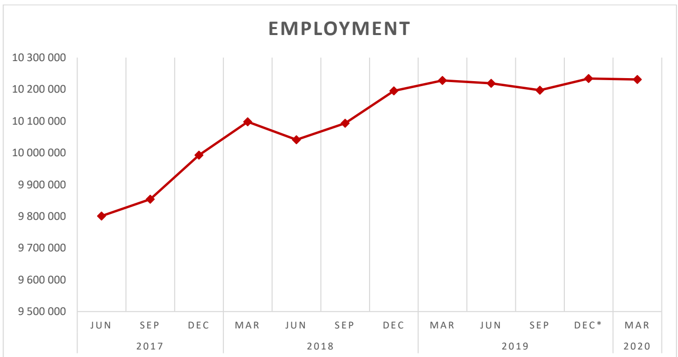
Figure A: Employment in the non-agricultural formal sector, June 2017 – March 2020.