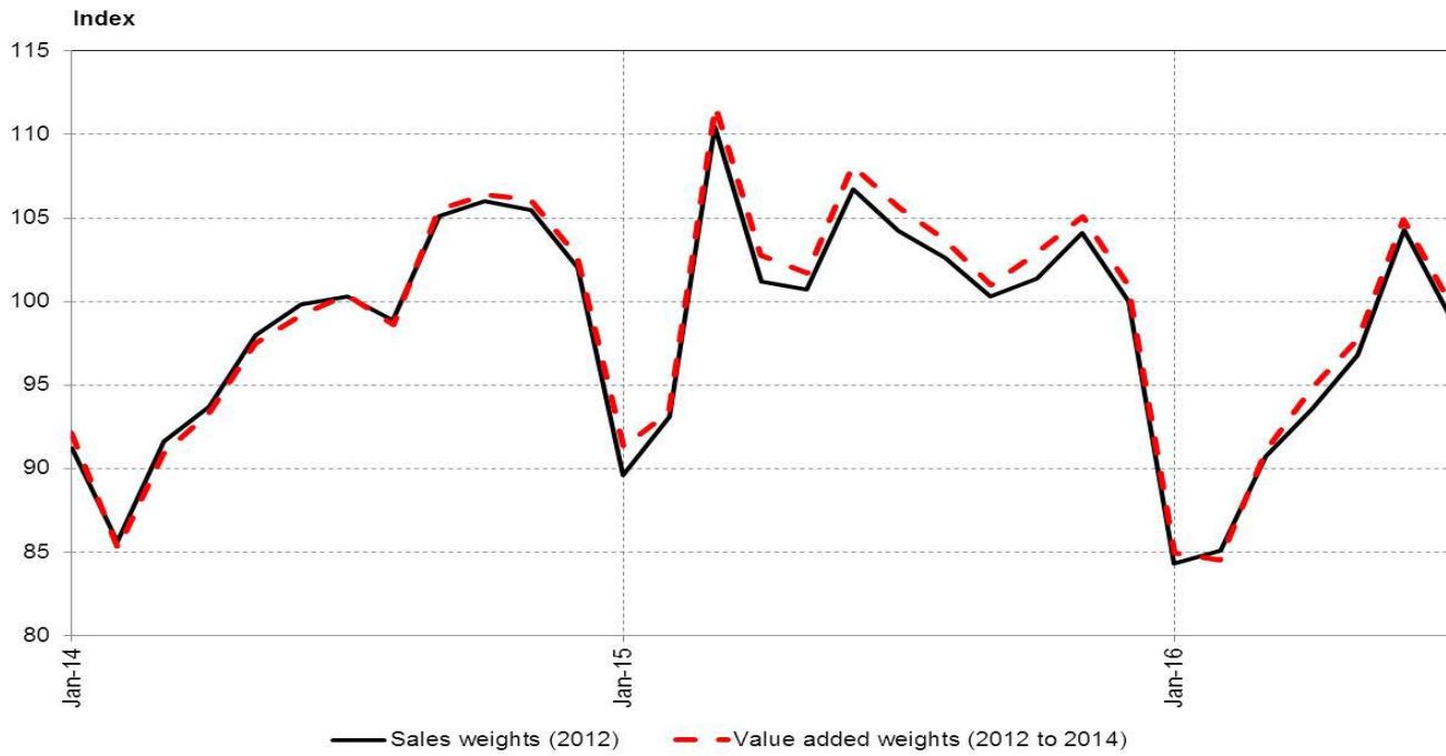
Figure 4 – Comparison of the annual growth rates for mining production based on old weights (sales) and new weights (value added)