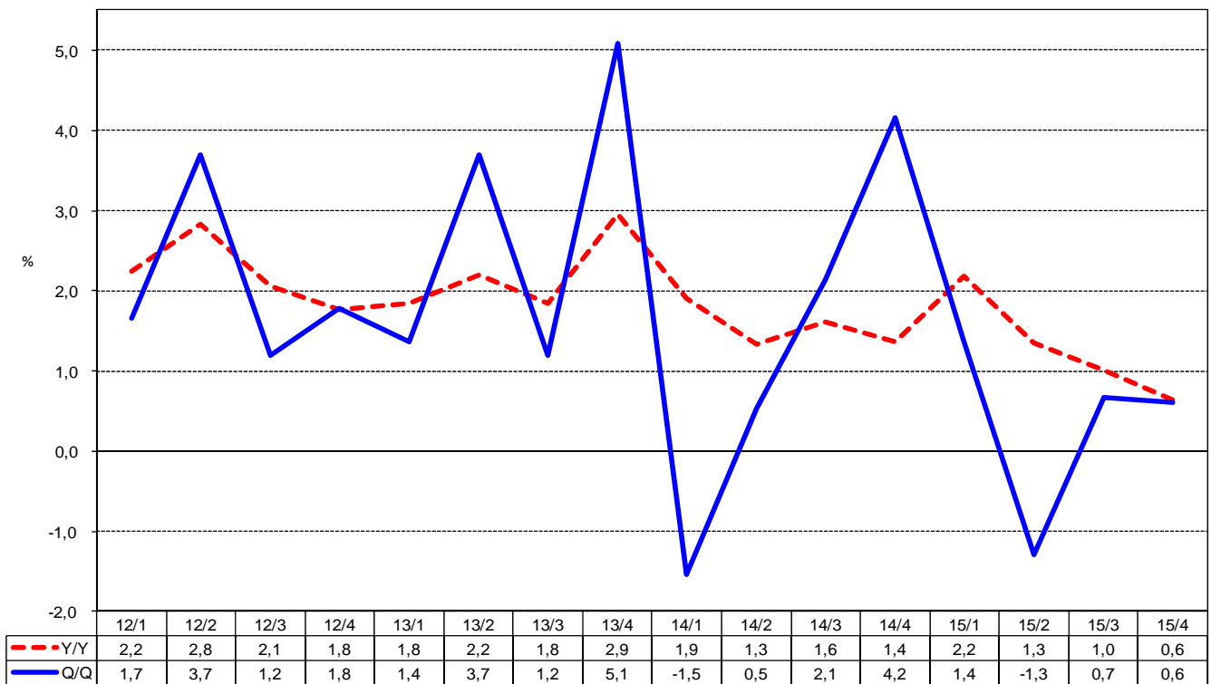
Figure 2 – Value added growth rates in various sectors (seasonally adjusted and annualised)