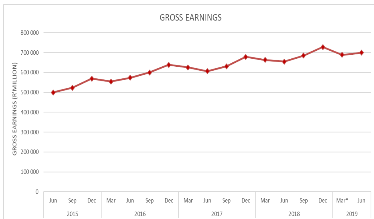
Figure B: Gross earnings of employees in the formal non-agricultural sector, June 2015 – March 2019