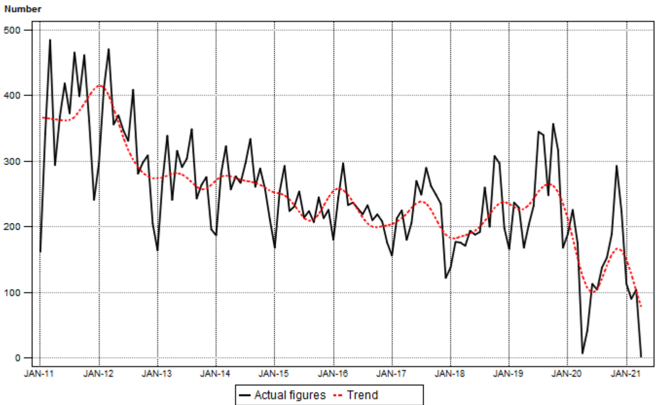
Figure 2 – Number of insolvencies

Seasonally adjusted insolvencies decreased by 97,2% in April 2021 compared with March 2021. This followed month-on-month changes of 18,9% in March 2021 and -43,4% in February 2021 – see Table 6.