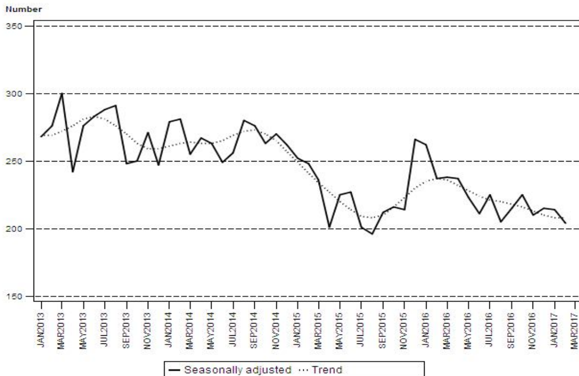
Figure 2 – Number of insolvencies

Seasonally adjusted insolvencies decreased by 4,7% in February 2017 compared with January 2017. This followed month-on-month changes of -0,5% in January 2017 and 2,4% in December 2016 – see Table 6.